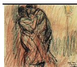
The Embrace, 1899 Chalk, 12.7 x 15.2cm Private collection