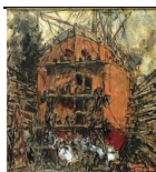
Ship in Dry-Dock, c.1924 Oil on paper, 50 x 44cm Private collection Van Mieghem has emphasised the towering scale of the ship in dry-dock, which is a narrow basin that can be flooded to allow a ship to be floated in, then drained to allow it to rest on a dry platform. This allows for the construction, maintenance and repair of ships.