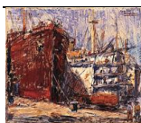
Ships in the Port, c.1924 Monotype, 28 x 33cm Eugeen Van Mieghem Museum