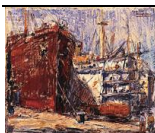
Ships in the Port, c.1924 Monotype, 28 x 33cm Eugeen Van Mieghem Museum