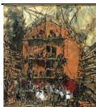
Ship in Dry-Dock, c.1924 Oil on paper, 50 x 44cm Private collection

Van Mieghem has emphasised the towering scale of the ship in dry-dock, which is a narrow basin that can be flooded to allow a ship to be floated in, then drained to allow it to rest on a dry platform. This allows for the construction, maintenance and repair of ships.