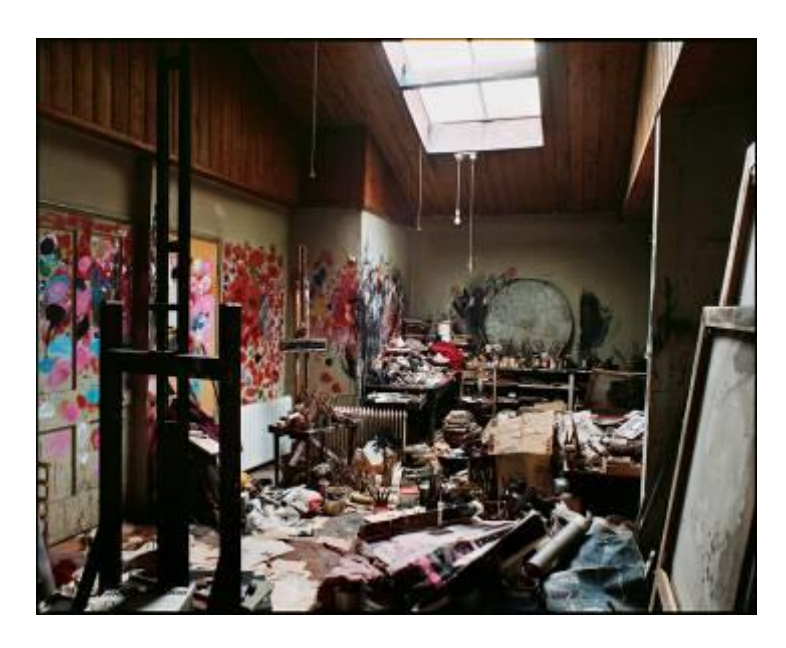
7 Reece Mews Francis Bacon Studio.

'I work much better in chaos, chaos for me breeds images'