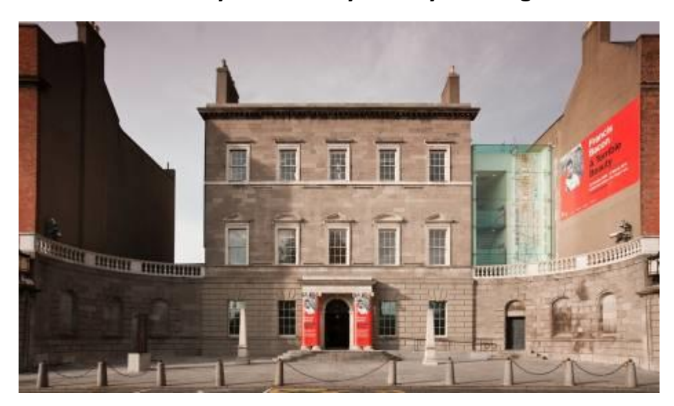
Exterior view of Dublin City Gallery The Hugh Lane

Include in your introduction to your gallery question a brief, concise overview of the name , location , function and history of the institution that is holding the exhibition. Here is some information to help you concerning Dublin City Gallery The Hugh Lane.