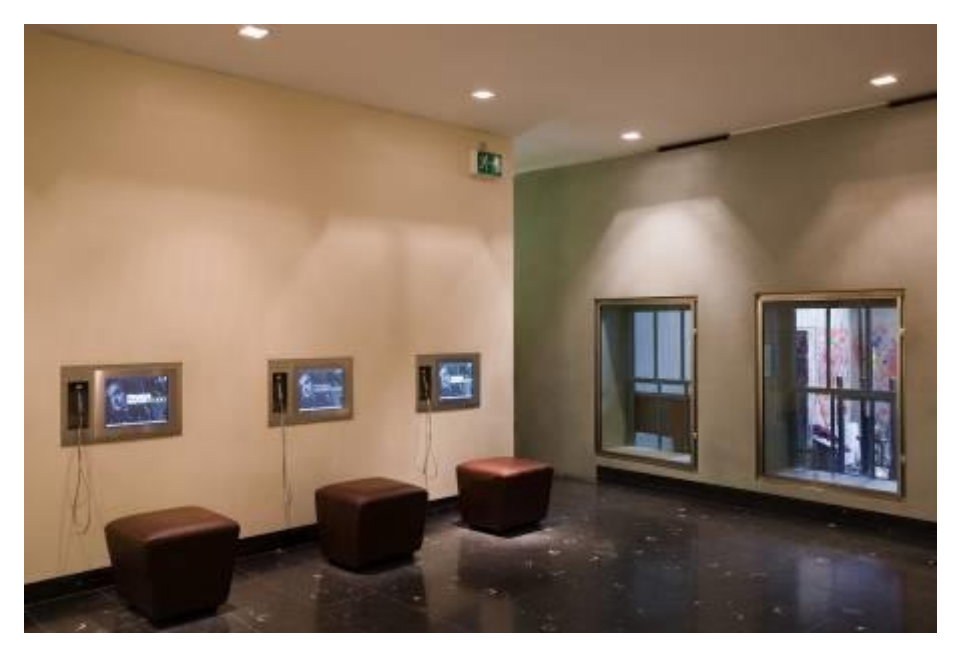
Installation view of the touch screen terminals in the Francis Bacon Studio complex.

The Micro Gallery, which comprises of seven interactive digital screens, gives the viewer the opportunity of exploring the studio in more detail. Each terminal acts as a comprehensive visual archive that contains an edited version of the Francis Bacon database that the gallery has compiled. The database was created 'to highlight the