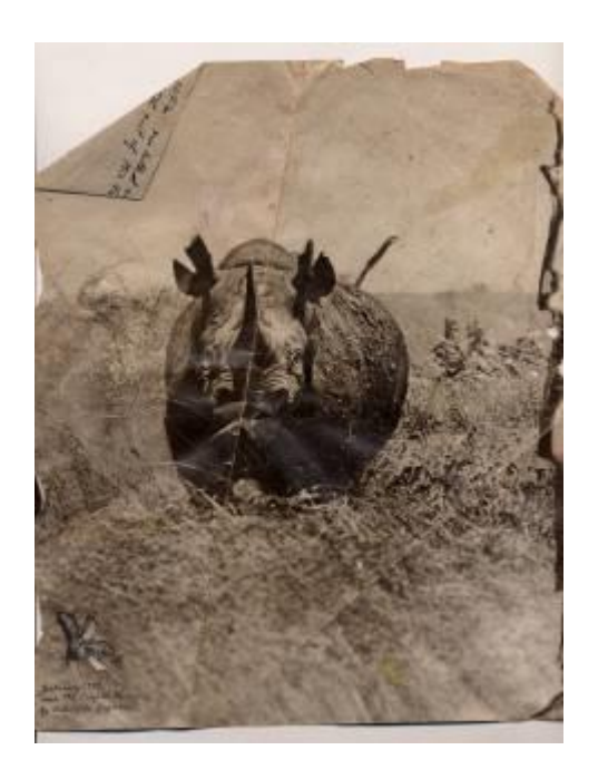
Photograph of Rhinoceros by Peter Beard found in Francis Bacon's studio. Collection: Dublin City Gallery The Hugh Lane. ©The Estate of Francis Bacon

The photographer Eadweard Muybridge, whose photographs capture the human figure in every conceivable action and activity, was another constant reference that Bacon returned to. Several copies of Muybridge's book The Human Figure in Motion and Animal Locomotion were discovered in Bacon's studio. (Dawson, 2009, p.59)