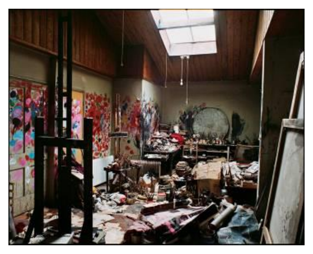
7 Reece Mews Francis Bacon Studio. Photograph: Perry Ogden. Collection: Dublin City Gallery The Hugh Lane. © The Estate of Francis Bacon

A Resource for Leaving Certificate Art, Craft and Design Students Considering the Gallery Question