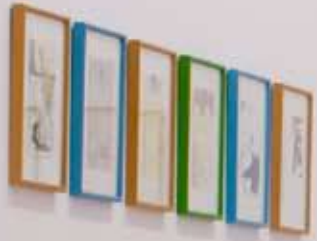
Ernst Lubitsch (ca. 1914-1915) Ernst Lubitsch Ernst Lubitsch Ernst Lubitsch