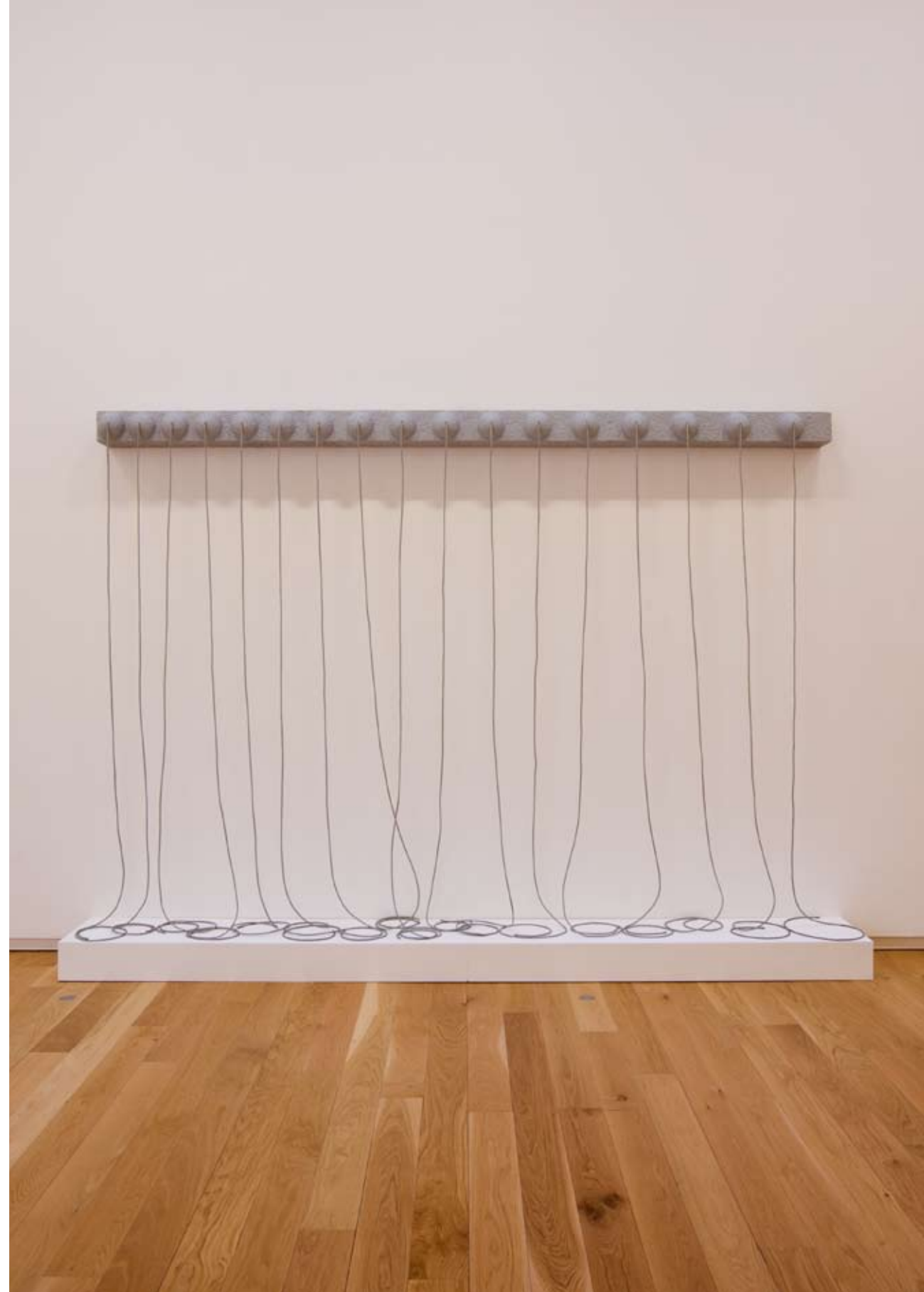
Eva Hesse Addendum 1967

Eva Hesse fled Germany with her parents, emigrating to New York in 1939 when she was three. Her parents eventually divorced, her mother committed suicide when Hesse was 10, her own marriage failed and her father died soon after, events that haunted her tragically short life. Symptoms of the brain tumour that eventually killed her first appeared in 1968 and she died in 1970 at the age of 34. In the last three years of her life, she worked at a furious pace, as if to outrun time, despite debilitating operations. By 1967, she had discovered latex. With fibreglass and plastics, it became the characteristic – and problematic – material of her celebrated soft sculptures, now mottled and so fragile that they are in danger of disintegration. They are eroticised, feminist versions of Minimalism – ‘psychic models’ of her interior life, the sculptor Robert Smithson called them – and her way of coping with emotional chaos. Addendum , 1967, in this exhibition, shows how she personalises the premises of Minimalism as she simultaneously contradicts them by incorporating references to the body. Made of painted papier-maché, wood and cord instead of steel, the strings drop from breast-like knobs, wavering delicately as they fall into a random swirl on the floor in defiance of Minimalism’s hard surfaces and calculated systems. Struggling for recognition in the male-dominated art world of the 1960s, Hesse re-invented sculpture in the process.