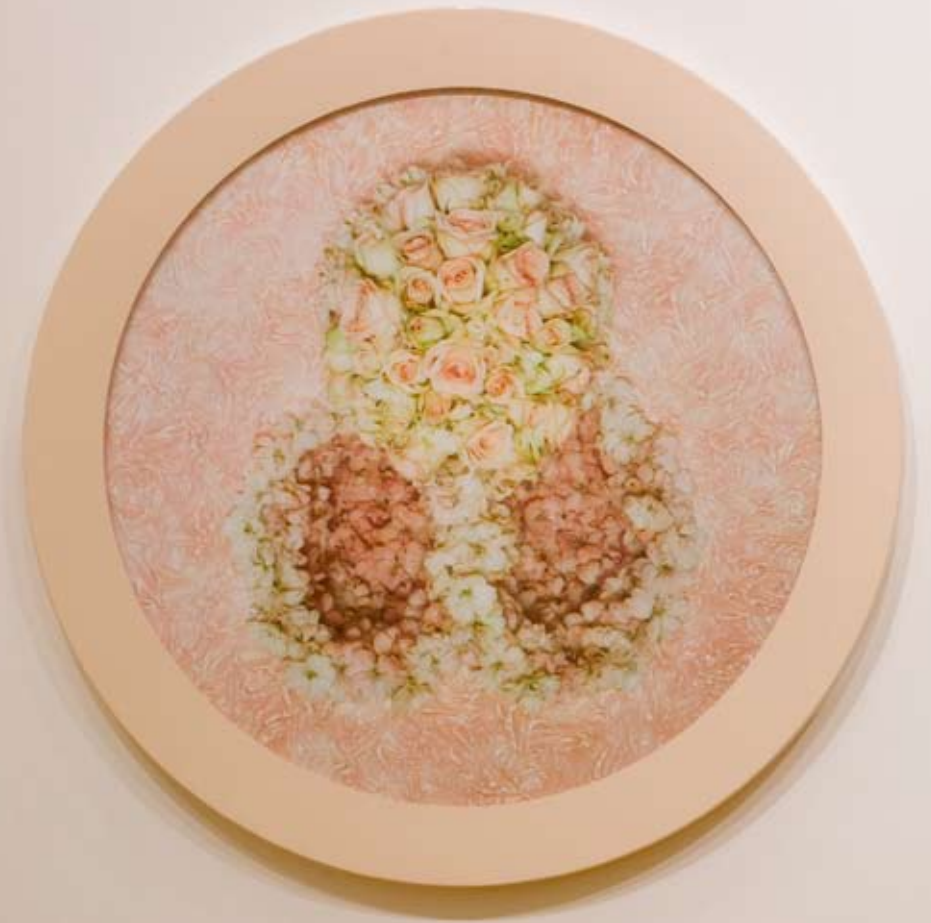
Helen Chadwick Wreath to Pleasure No. 10 1992/3